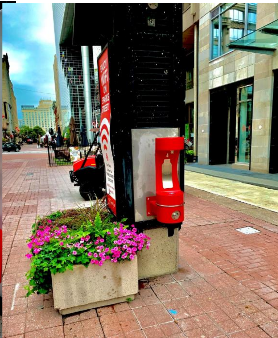
Photos: Sparks Street Bottle Filling Stations. GreenSpec listed, and installed to accessibility requirement standards, water tested by City of Ottawa