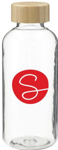
Branded bottles for Spring launch, made 100% Recycled materials