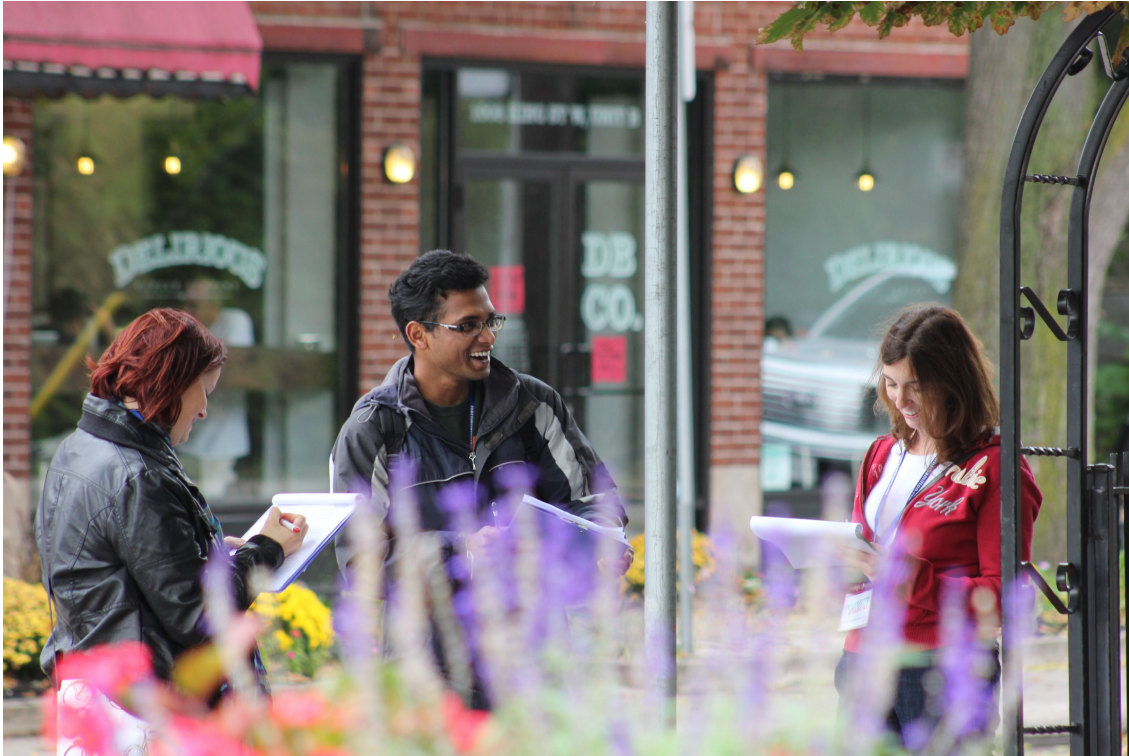
Residents, Community Groups, Students